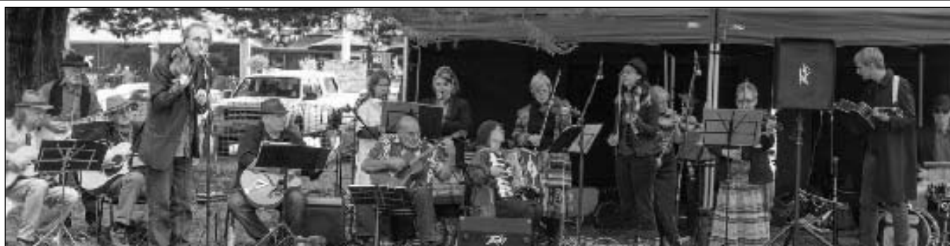
Music fills the air at Malmsbury