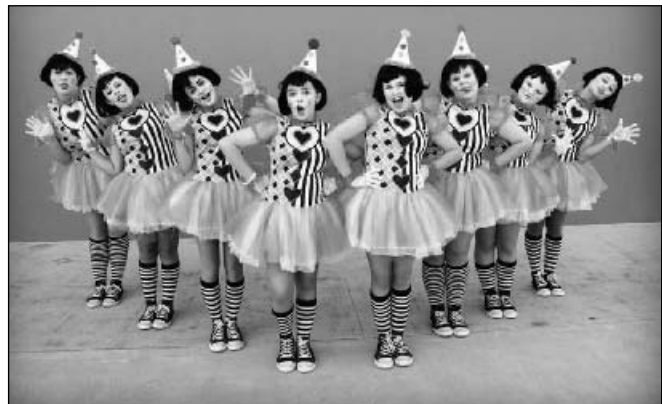
A drill dance team