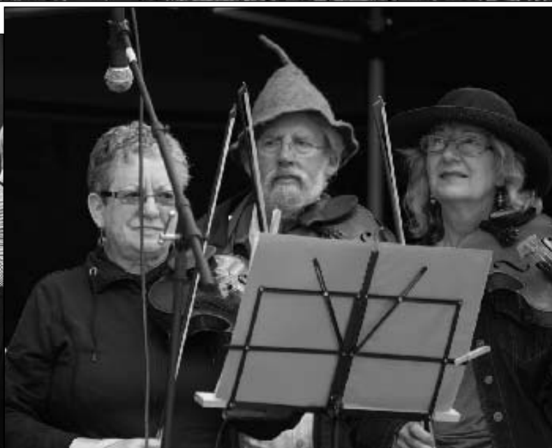
Malmsbury is known for its music and the Malmsbury Fayre has become famous for its setting on the beautiful Malmsbury Botanic Gardens.