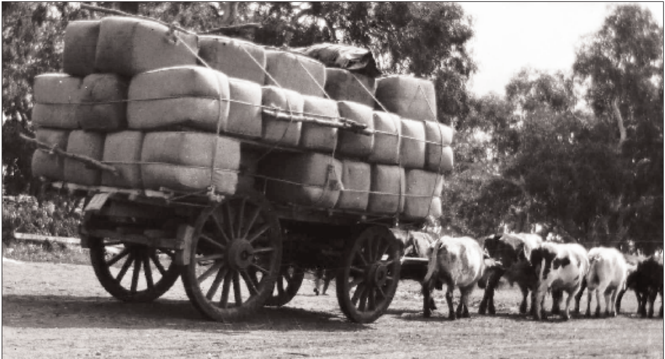
A nostalgic look at the past

Mia Mia Celebrated its History at the launch of 'Mia Mia The Place and its People'.