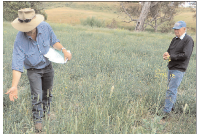
Checking results of needle grass eradication near the Campaspe River.

Landowners along the Campaspe River have reported a huge increase in Texas Needle Grass, especially after flooding in 2010 and 2011. The weed is now a serious problem, both here and in Malmsbury and