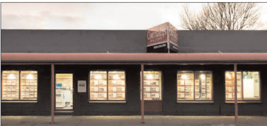
The iconic Connally office in Heathcote

For more than three decades Connallys Real Estate has built a name of honesty, trust and integrity. This was the vision of the founders of the company. The company specialises in Commercial, Residential, Rural, Farmlets, Development Land, Units and Houses and can also take care of your clearance sale needs.