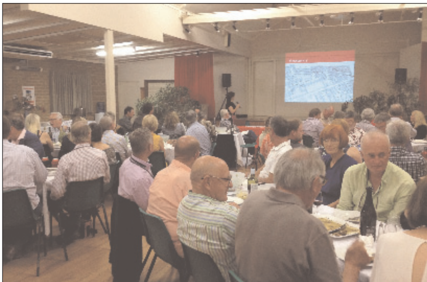
Guests enjoyed a delightful meal at the Dinner plus talk

It is hoped the Dinner plus Talks will continue next year and the District Association is hopeful people will come forward with suggestions for topics and speakers. This was a great way to catch up with friends and neighbours and to enjoy local produce and artworks.