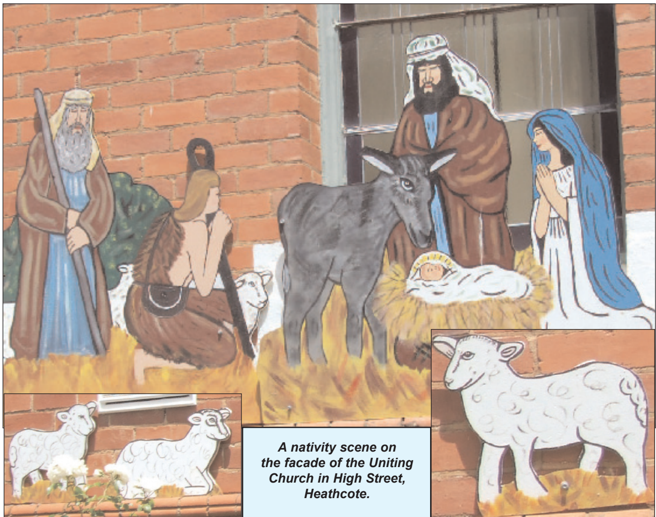
A nativity scene on the facade of the Uniting Church in High Street, Heathcote.

Christmas is a birthday celebration. Christmas Day is the day we celebrate the birth of Jesus Christ and with it Christianity. Celebrations are usually a time of enjoyment and of