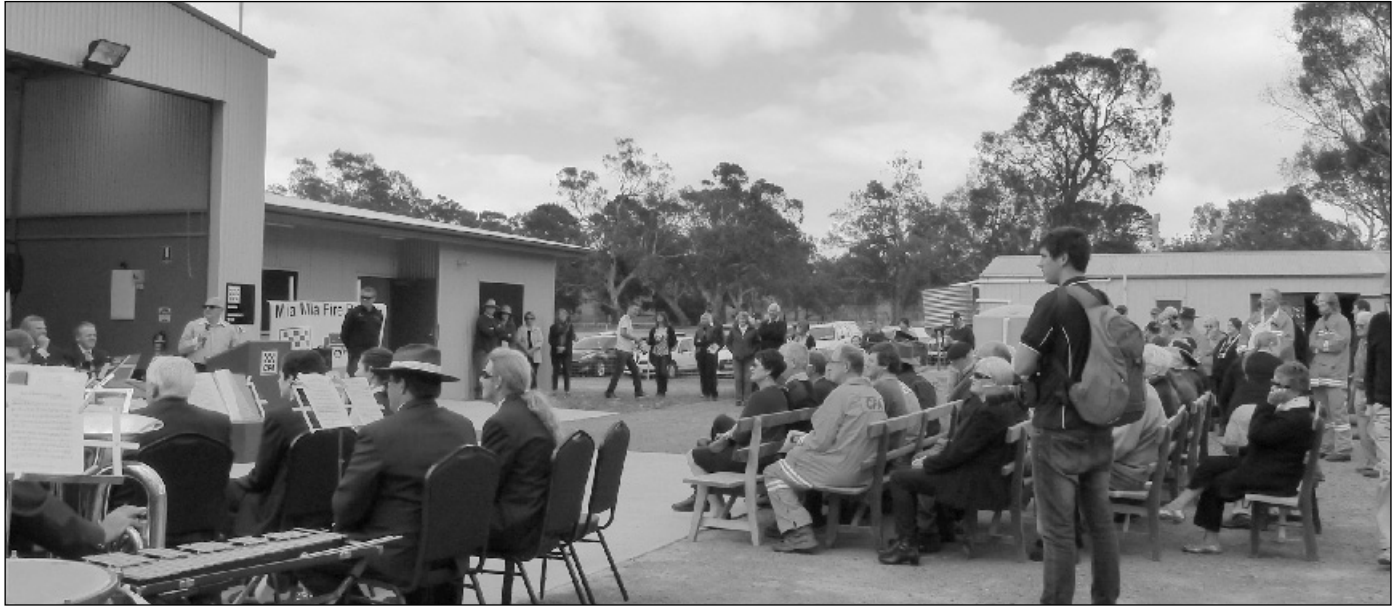
More than 120 people gave their blessing to the new fire fighting facility at Mia Mia.