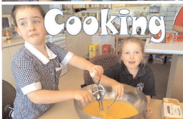
Cooking Making Egg and Bacon pies with eggs from our chooks.