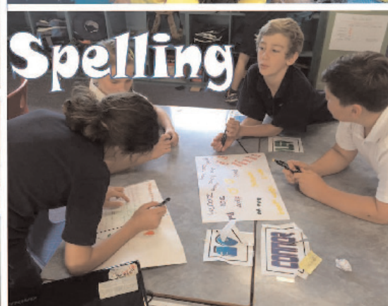
Spelling Students investigating all the double o words. We found that double o makes at least 7 different sounds. The biggest word with double o was Woolloomooloo with 4 double o's!