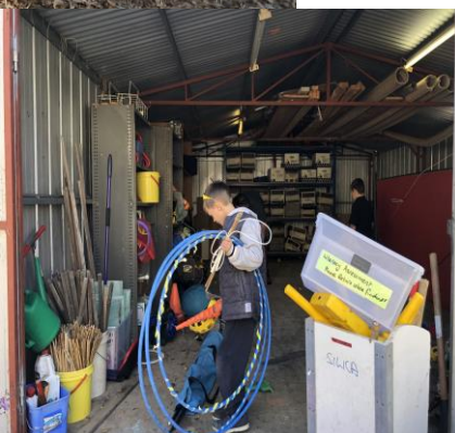
Cleaning out the shed!